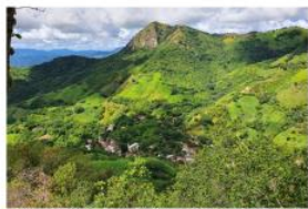
Words into Action...